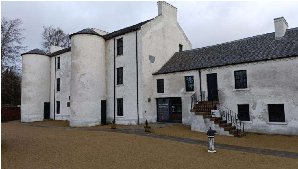
The recently refurbished David Livingstone Birthplace Centre