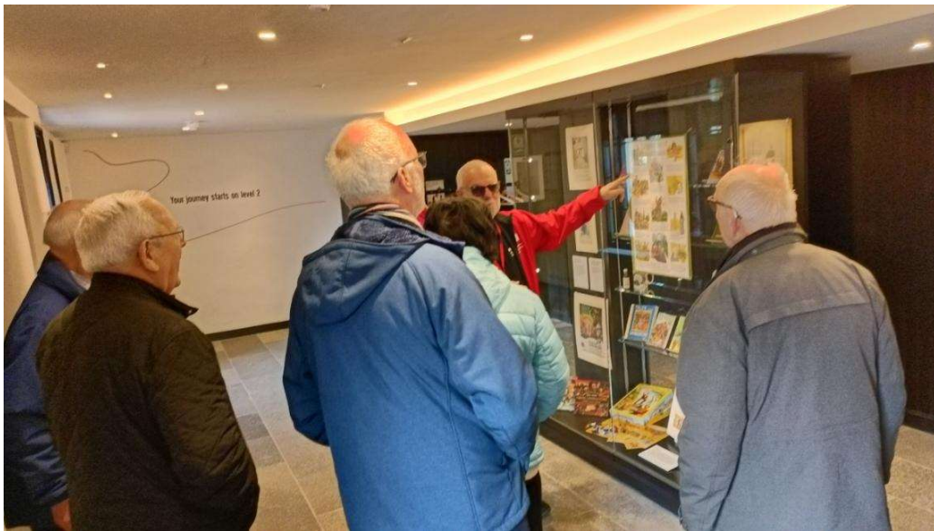
The museum was actually closed on that day. The Centre specially arranged two guides to lead us through the museum, and gave a very comprehensive introduction to the life and achievements of David Livingstone. This is the second group.